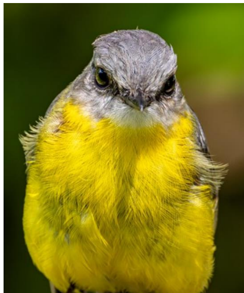
Eastern Yellow Robin